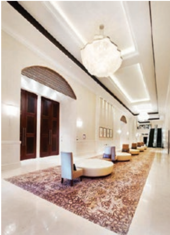
HOTEL/ FIT OUT/ ID WORKS