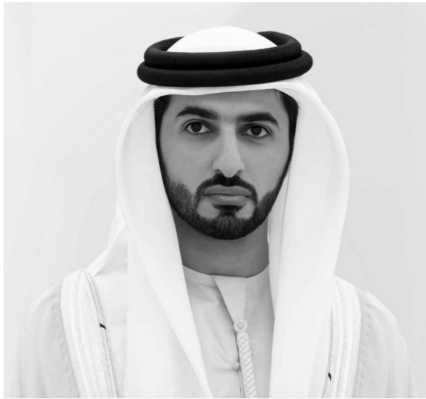
His Highness Sheikh Rashid bin Humaid Al Nuaimi